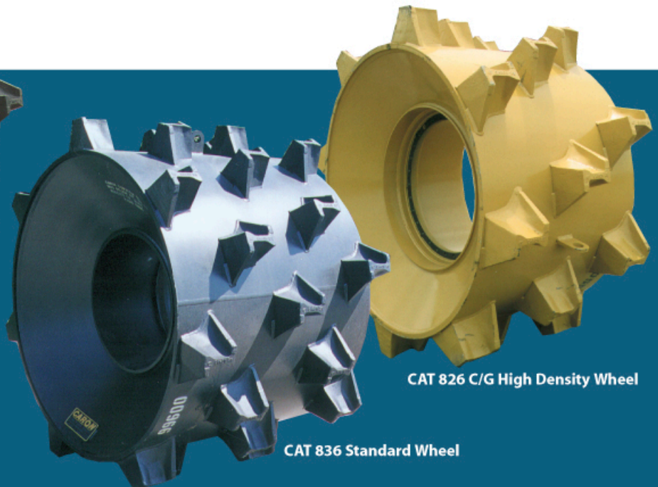
CAT 826 C/G High Density Wheel

Field installed on-site. Exchange recleat or rebuilt wheels available.