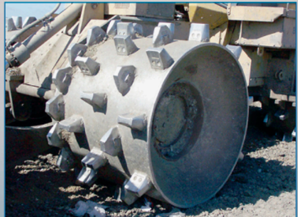
The Caron Wire Safeguard Group with patented Pin-On technology stands out from the competition and fights wire build-up effectively and economically. Shown with the continuous Wire Safeguard Group pattern.

Wire wrapping problems have finally met their match. Introducing the Caron Wire Safeguard Group (WSG), an economical, long-lasting protection system that all but eliminates landfill wire wrap issues. Built with legendary Caron value and quality, the Caron Wire Safeguard Group uses hardened alloy steel tips – Caron Contour Pin-On® Teeth – to outlast competitive fabricated steel rings. Using this system, the WSG can be replaced as part of the normal tip maintenance schedule, resulting in less man-hours and less downtime than weld-on ring guards. Add a 10,000 hour wire guard wear guarantee and the Caron Wheel with WSG is hard to beat. Save both time and money: contact Caron for complete information.