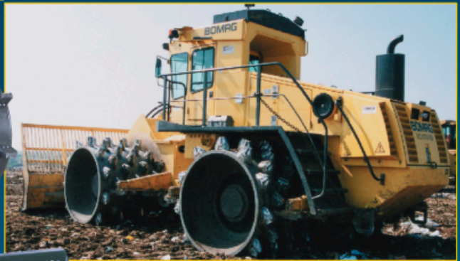
Bomag BC1172RB shown with Caron BMAX Wheels