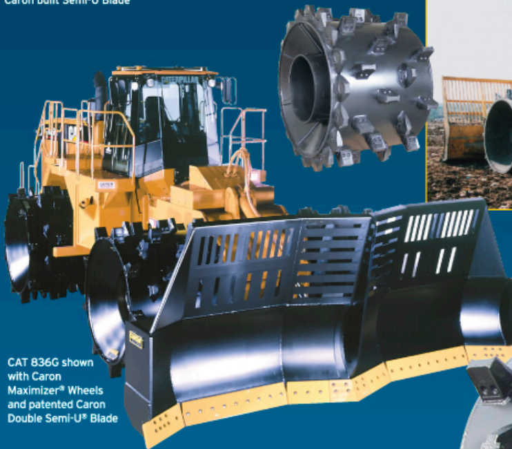
CAT 836G shown with Caron Maximizer ® Wheels and patented Caron Double Semi-U ® Blade