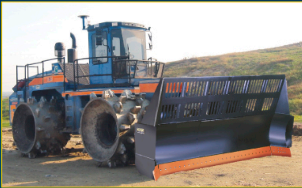
Al-Jon Advantage with Caron MAX ® II Wheels and available Caron built Semi-U Blade

Caron Wheels with Pin-On Teeth ® , Double Semi-U ® Trashblades, Semi-U Trashblades, Guard Groups and the NEW Patented Wire Safeguard Group (WSG) in both Intermittent and Continuous Configurations - each engineered to meet the specialized needs of Al-Jon, Bomag and Caterpillar Landfill Compactors.